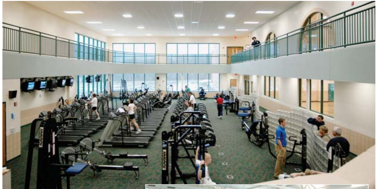
Ohio's Mason High School was constructed with an adjacent community center through a school-city partnership.

While a number of community schools have been built in North America, the community school movement hasn't completely taken off. One reason is that the public and private sectors are separate entities. Even though schools and cities serve the same constituencies, they have their own governing structures, tax revenues and bureaucracies. They